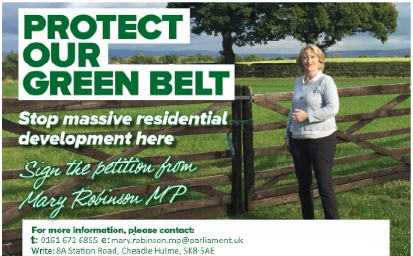
Petition campaign poster, Mary Robinson MP, bramhallweb.co.uk , 28 November 2023