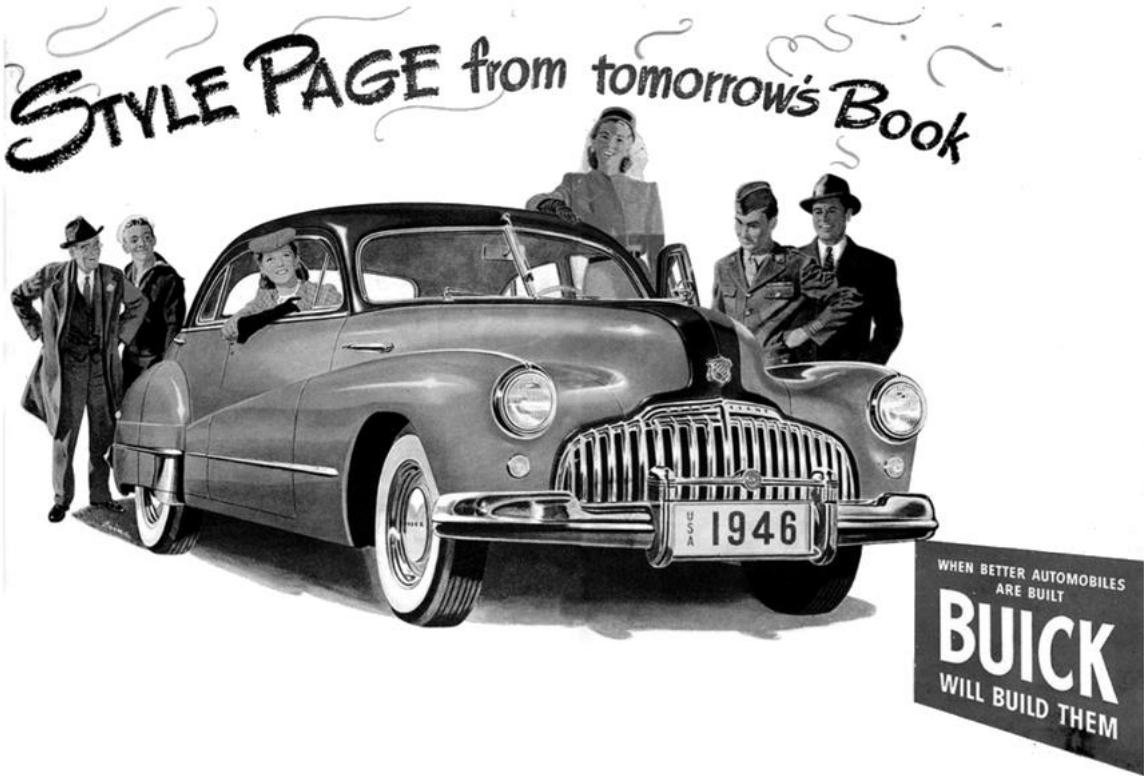
Buick vintage advertising, 1946